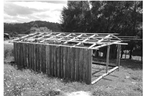
Provide family shelter