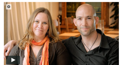
Hearts For Outreach from Creative Impact Ministries PLUS 6 days ago