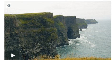
Ireland Crossroads Documentary from Creative Impact Ministries PLUS 1 week ago