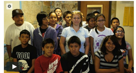
Immanuel Mission: God With Us from Creative Impact Ministries PLUS 1 year ago

We are so thankful to you for caring, for praying and for giving.