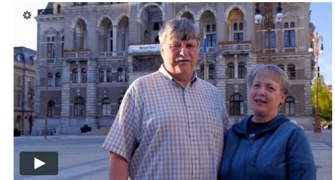
Czech Mates Documentary from Creative Impact Ministries PLUS 5 months ago