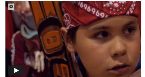
Klawock Carving Shed Project from Creative Impact Ministries PLUS 4 months ago