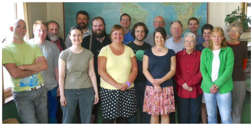
OM BELGIUM TEAM - These missionaries come from all over the world! In this photo, 11 nations are represented. Can you pick out the two missionaries who were born in the USA? Probably not!